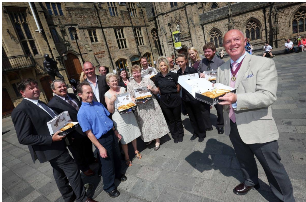
FIGURE 1 DELEGATES SHOW OFF SUSTAINABLE FISH & CHIP DINNERS FROM BELLS FISH RESTAURANT

http://www.durham.gov.uk/media/6824/Sustainable-Buying-Standard-Food/pdf/SustainableBuyingStandardForFood.pdf ).